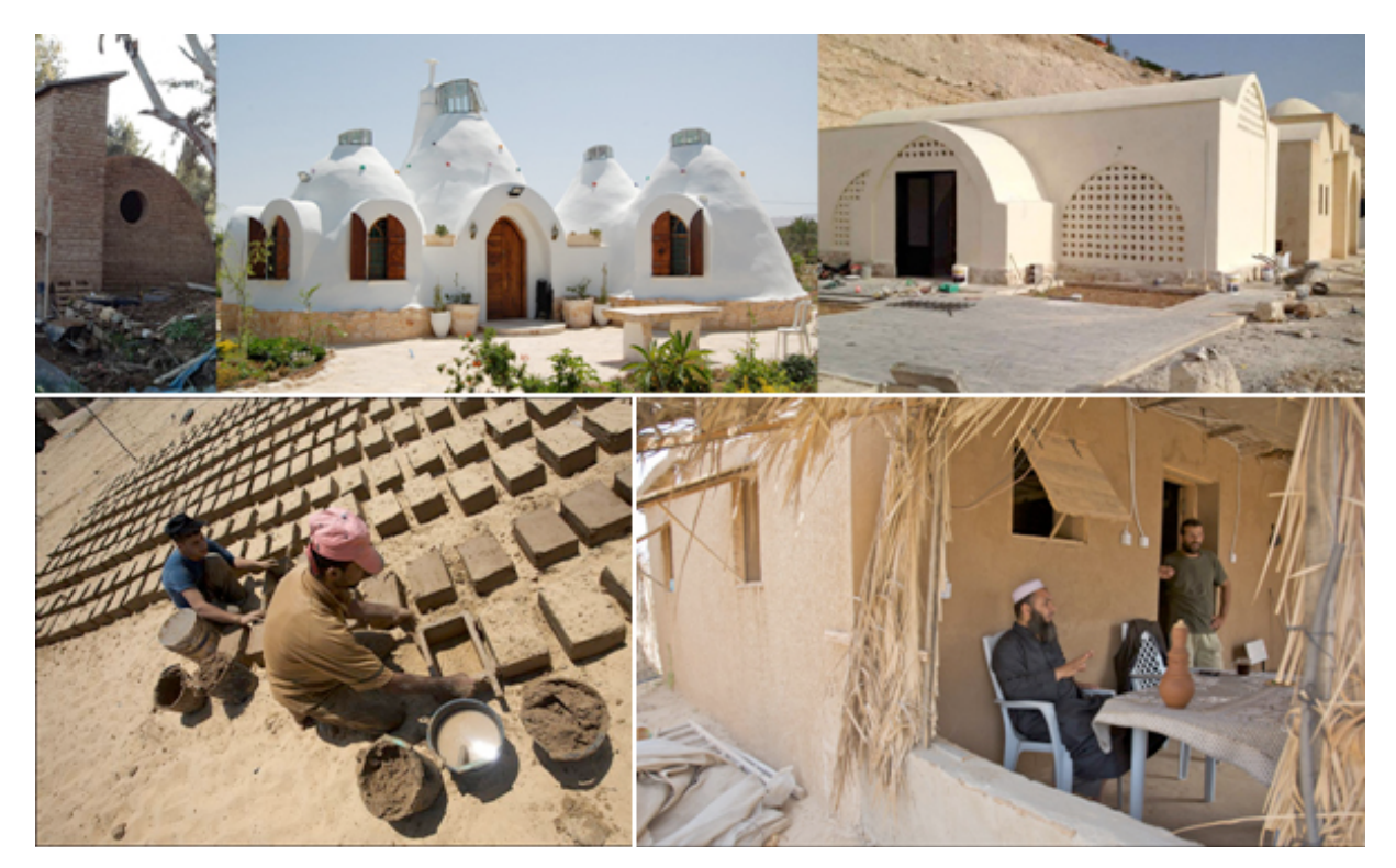
Figure 2. New earthen construction in Ramallah, Jericho, Gaza, and the Jordan Valley, Palestine [UNESCO Ramallah Office, Shams-Ard EDS, <a href="http://news.bbc.co.uk/2/hi/middle_east/8068864.stm">http://news.bbc.co.uk/2/hi/middle_east/8068864.stm</a> (04/15)].

The strategies beyond these attempts were to present earthen architecture combined with new and recycled materials (locally collected) to reduce costs in providing ecological housing in emergency situations [4]. Implementations were focused on constructing community centres as examples for the society, looking for sources of inspiration, learning from the Past for sustainable technological innovation, and locations of high thermal excursion. The public participation was considered as one of the focal points in these projects. Nevertheless, after a number of years since the implementations, a certain post-occupancy evaluation should take its place in order to get a direct feedback from occupants about the efficiency of the system, the building, the earth material, etc.