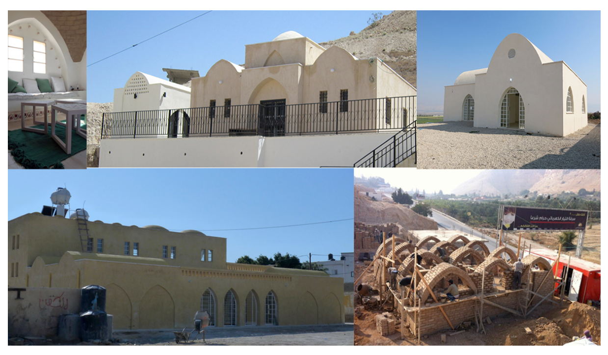
Figure 1. New earthen construction in Ramallah, Jericho, Gaza, and the Jordan Valley, Palestine.

A group of attempts have emerged recently in Palestine to revive the earth as an alternative construction material to some extent. This opens up a door to rethink of the achievement of environmental needs, and the enrichment of socio-cultural aspects within the design of the earthen house. Different earthen buildings were implemented since the last decade in the Jordan valley, Jericho city, Dyouk village, Aqbat Jabr refugee camp, Bardalah village, Aqrabaniya village, and Gaza strip (Fig. 1, 2). These attempts of reviving earthen architecture in Palestine were carried out and implemented individually or by some non-governmental organizations such as UNESCO, Shams-Ard Environmental Design Studio, and BGF (Building Green Futures).